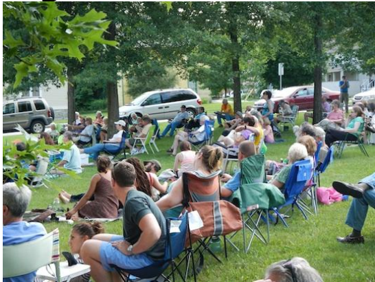
Part of the crowd at the Gypsy Reel concert on the Proctorsville Green in 2013

Again this year the Town of Cavendish will host a Wednesday evening summer music series on the Proctorsville Green. Each show will begin at 6:00 p.m.