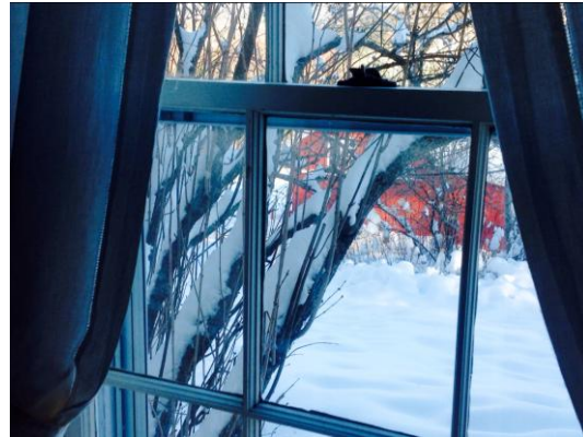
Winter Morning by Noelle Gignoux