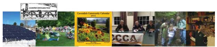
ENERGY COMMITTEE • CONCERT ON THE GREEN • CANDIDATES NIGHT • CAVENDISH COMMUNITY FUND • COMMUNITY CALENDAR • CONSERVATION COMMITTEE