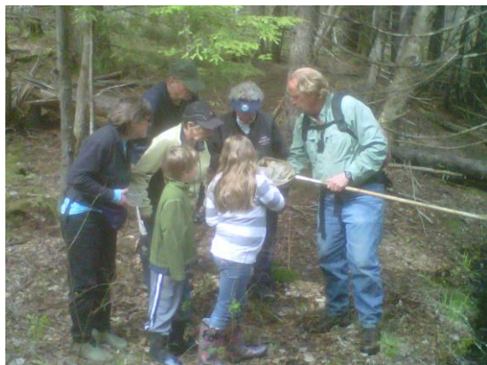
A group examines the contents of a vernal pool in a previous Walk and Talk event