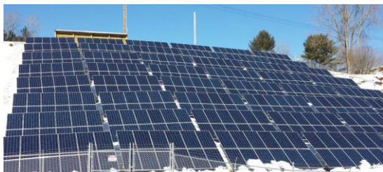
The New Cavendish Solar Array

This past year saw the installation of a 148 KW solar array on town owned land. The electricity that it generates is fed directly into the grid, but offsets the electricity used by Cavendish at the town office, the transfer station, the water filtration plant, and at the wastewater treatment facility. The effort to create this green energy generation array was spearheaded by the Energy Committee.