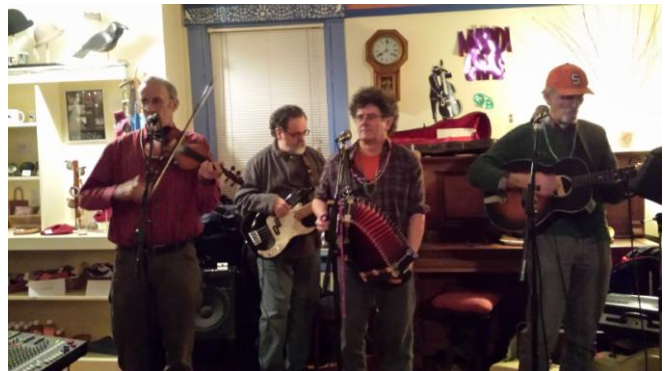
Yankee Chank performs at the Annual Mardi Gras Party in Proctorsville